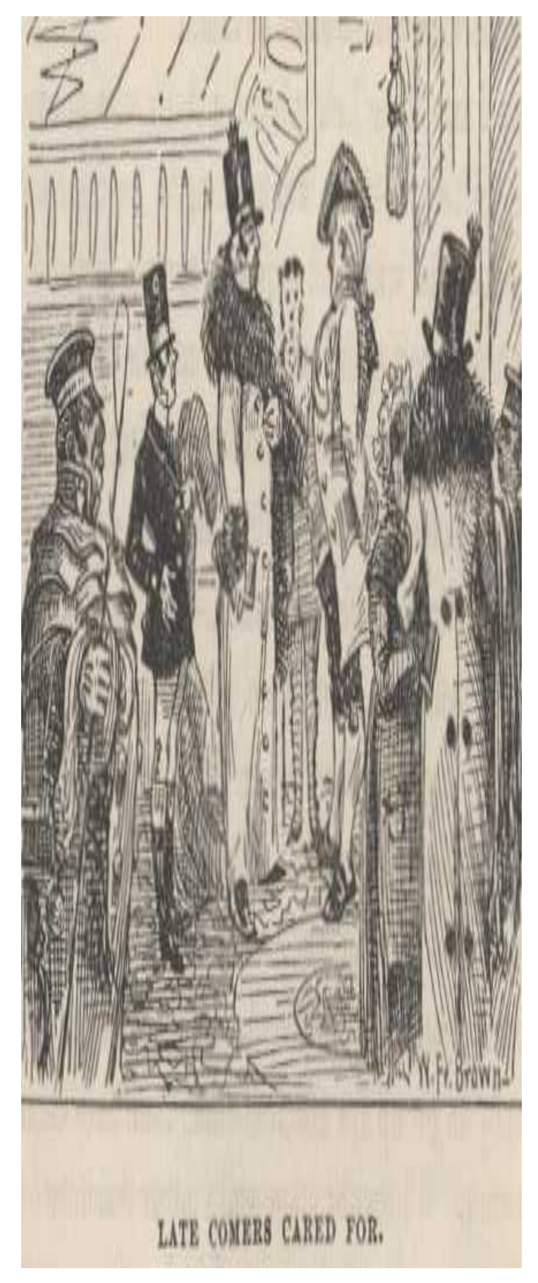
Sketches New and Old, Illustrated, v2