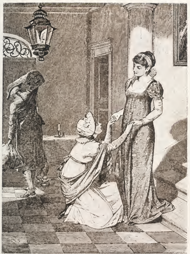
CHARLOTTE RECEIVES OTTILIE