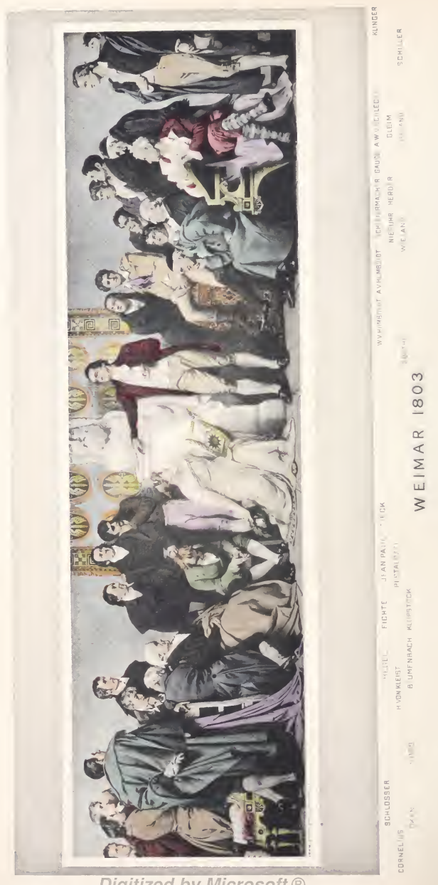
Digitized by Microsoft ®