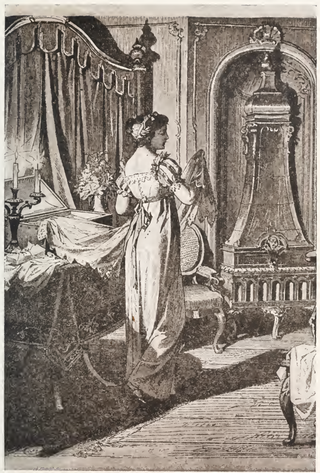
OTTILLE EXAMINES EDWARD'S PRESENTS