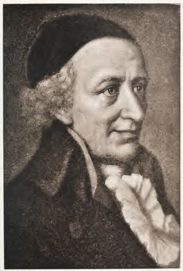
Permission E. Linde & Co., Berlin